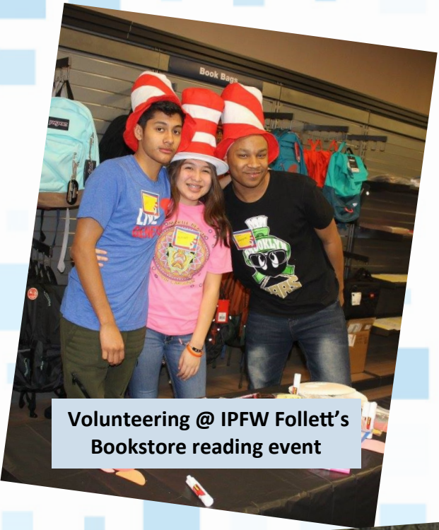
Volunteering @ IPFW Follett's Bookstore reading event